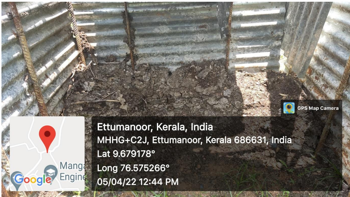
Fig 1, Solid Waste management at the campus ( Composite formation)

7.1.3 Describe the facilities in the Institution for the management of the following types of degradable and non-degradable waste