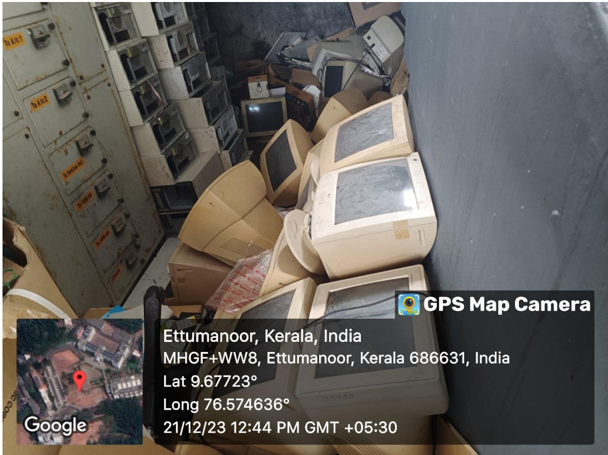
Fig 4, E Waste management