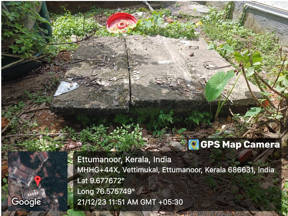
Fig 2, Liquid Waste Mangement