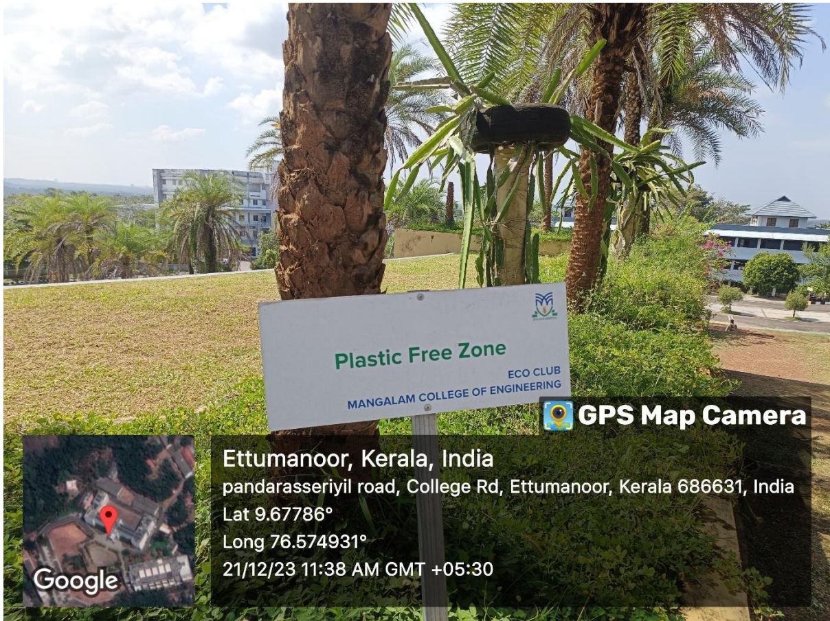
Fig 7, Sign board representing the Plastic Free Zone