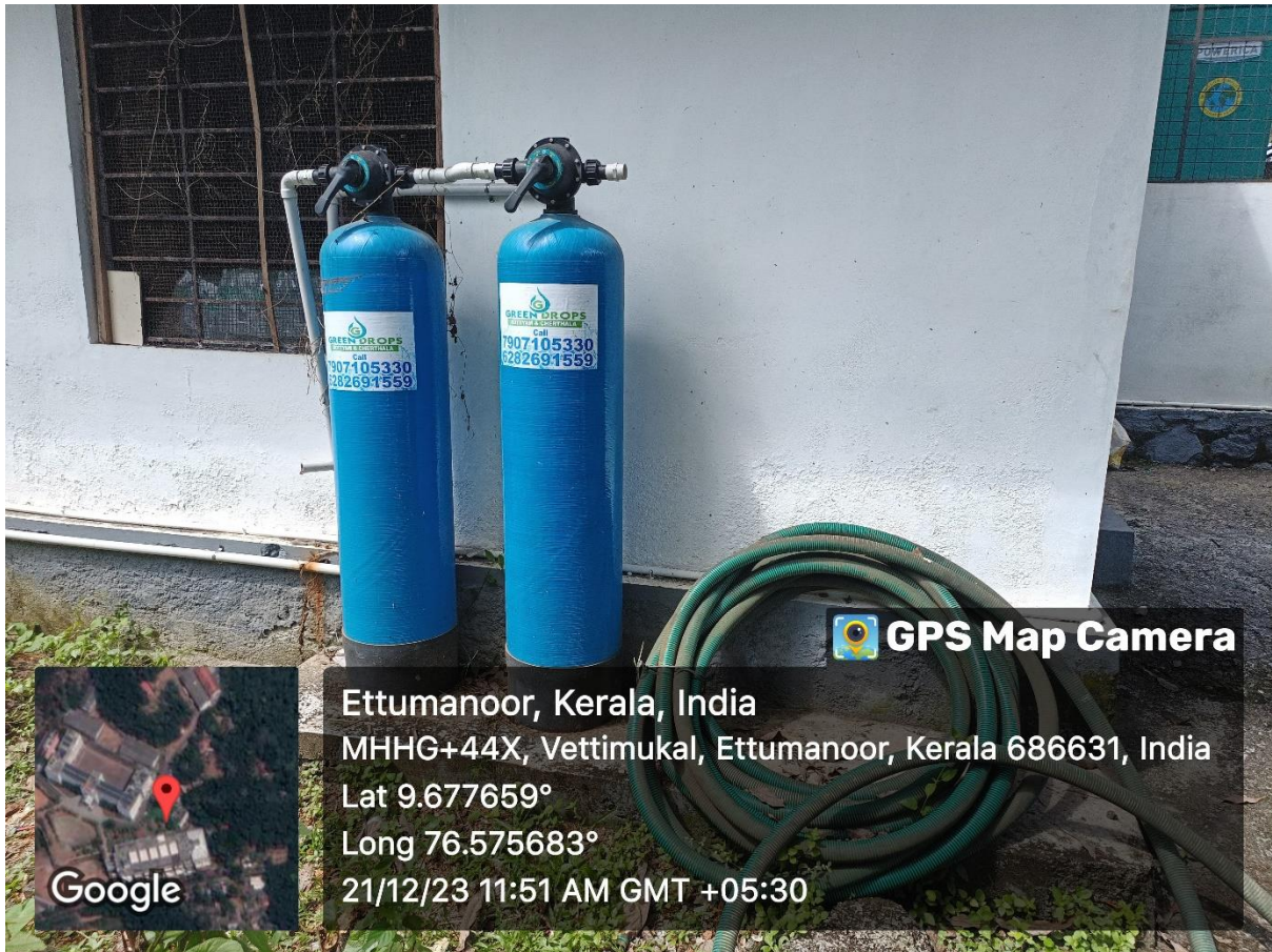
Fig 3, Water recycling system