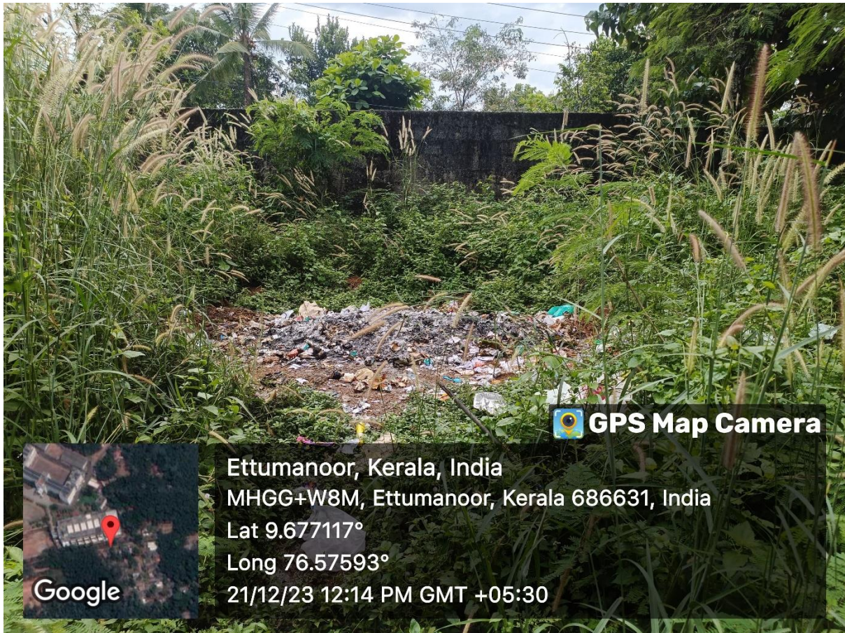
Fig 5, Waste Recycling