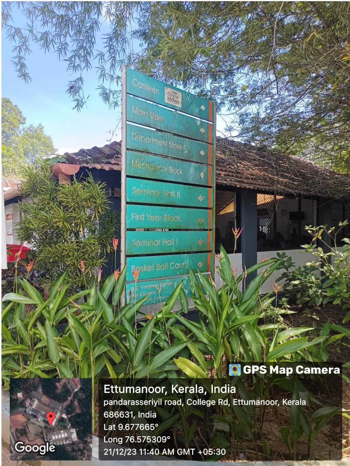
Fig 5, Signposts