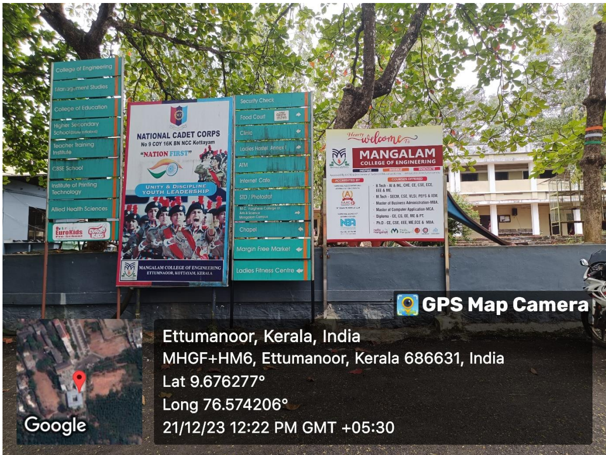
Fig 4, Signposts