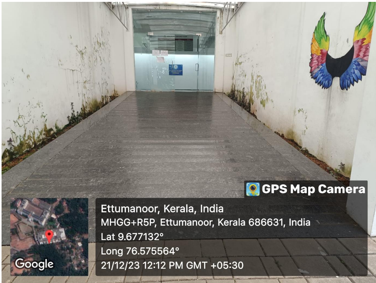
Fig 2, Ramp at the Campus